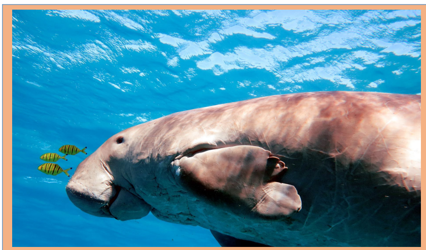
SHARK BAY DUGONG