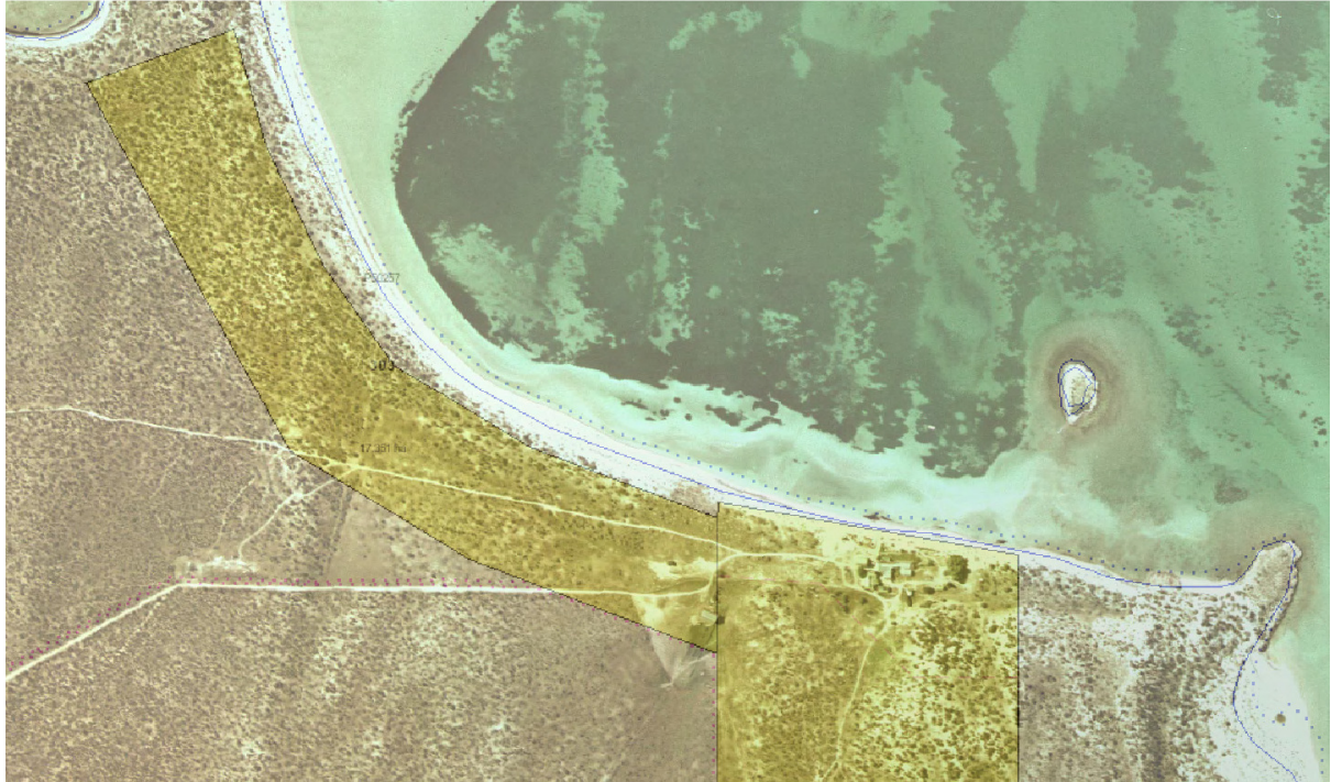
2002 Aerial Photograph