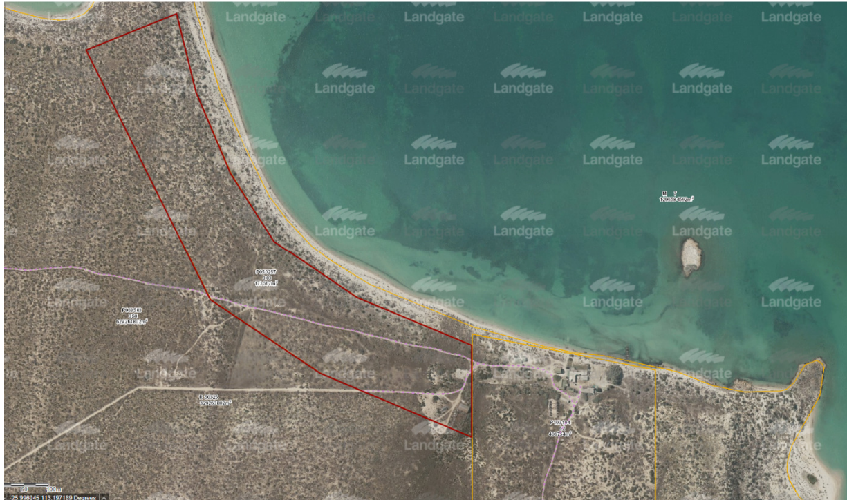
2015 Aerial Photograph