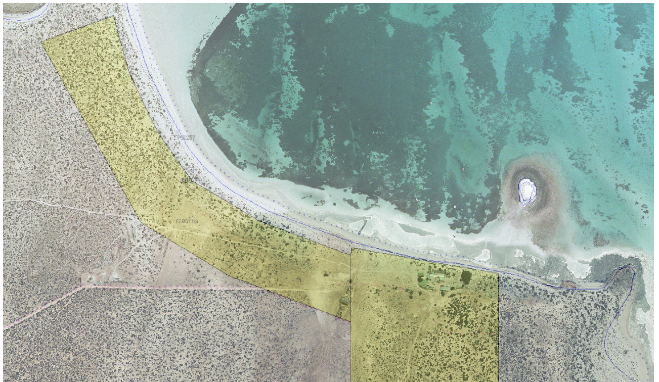
2007 Aerial Photograph