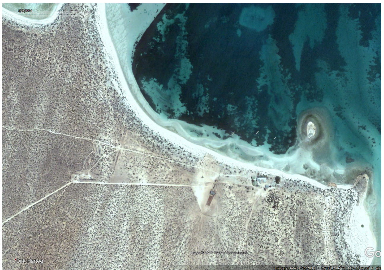
2004 Aerial Photograph