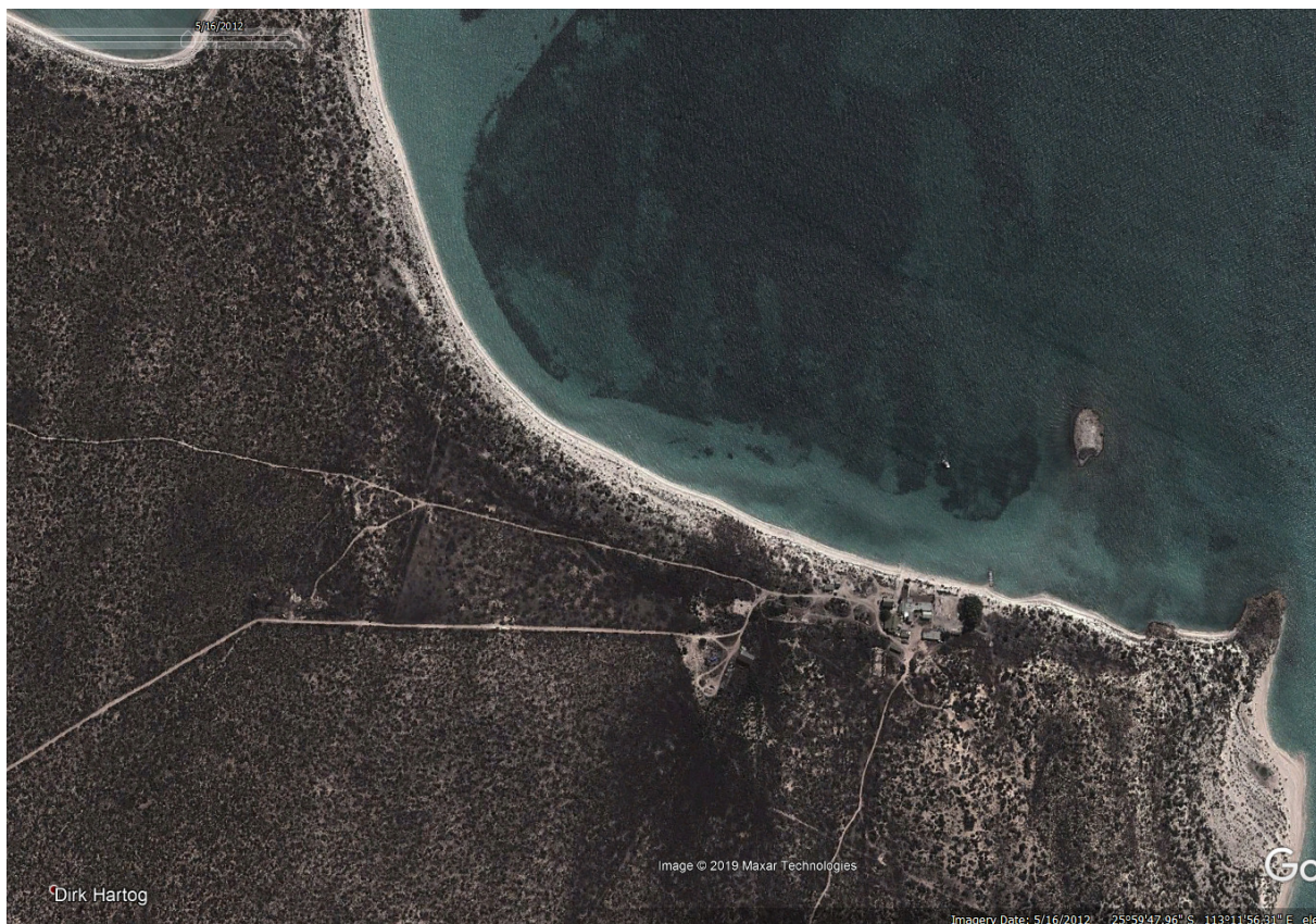
2012 Aerial Photograph