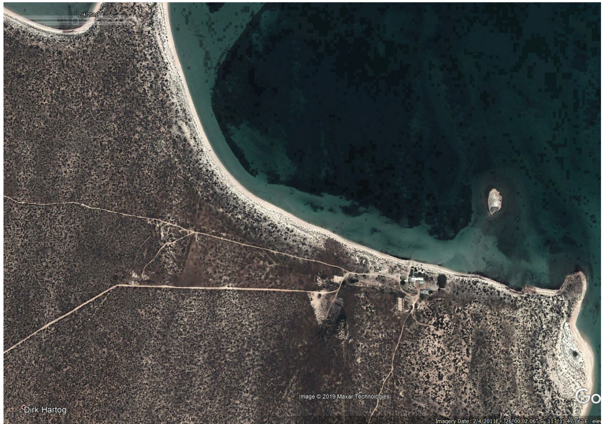
2011 Aerial Photograph