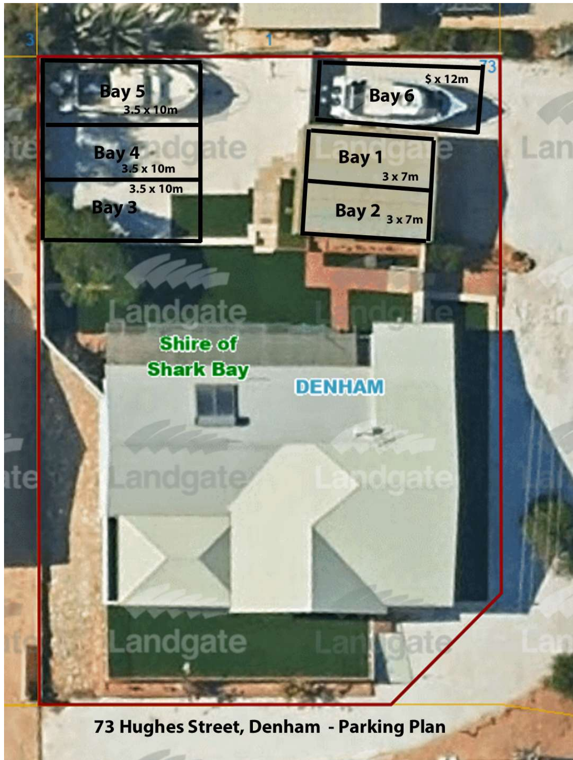
73 Hughes Street, Denham - Parking Plan