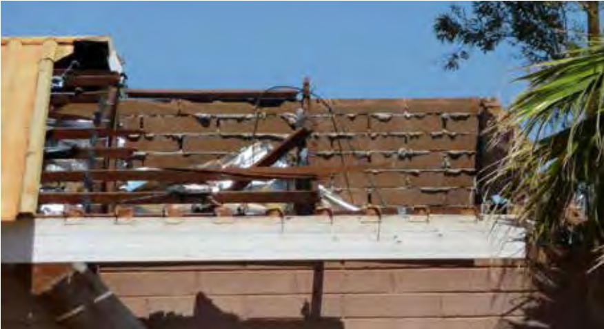
Figure 11: Roof failure following a cyclone. Older properties are particularly vulnerable to damage. If you are reroofing your building, also check the roof structure and tie- downs.

Some properties built before the mid-1980s might not be constructed to current building standards; the connections and materials might not be strong enough to resist cyclonic winds. Roof battens that are poorly connected to rafters or trusses are a common weakness in older buildings.